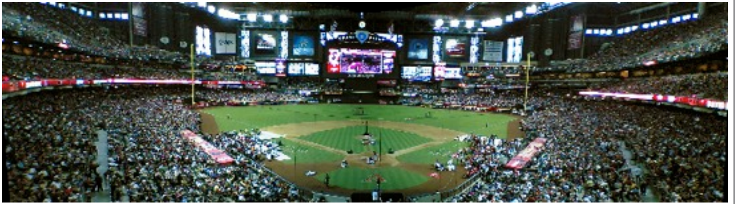
Home Run Derby

With the Diamondback hosting the MBL All-Star Game, its been baseball, baseball, baseball. And now that the D-Backs are almost certain to make the play-offs, it's even more baseball. Here's a few photos from this season.