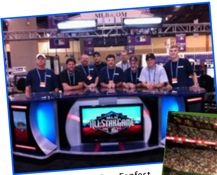
MLB.com All-Star Fanfest