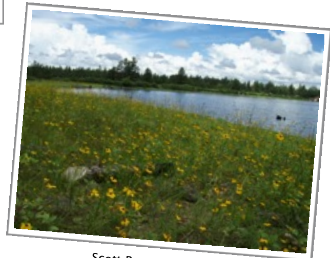
Scott Reservoir: Show Low