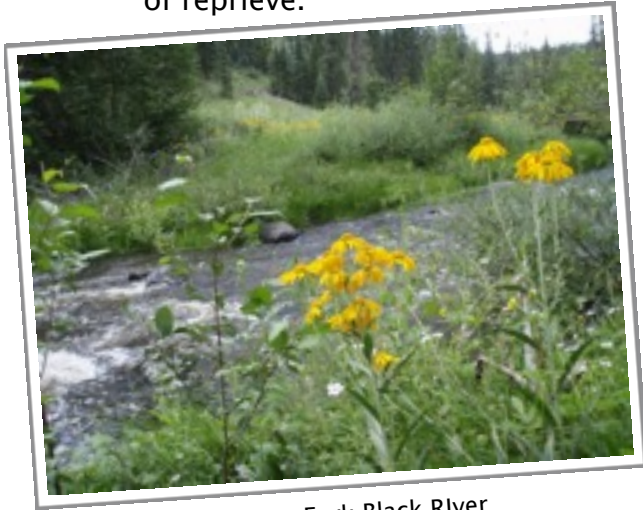
West Fork Black River

Now that we are in the depths of monsoon season with high temps and just as high humidity, here's a few photos that may give you a bit of reprieve.