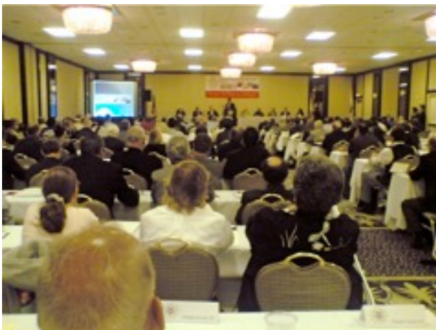
District 2 Convention