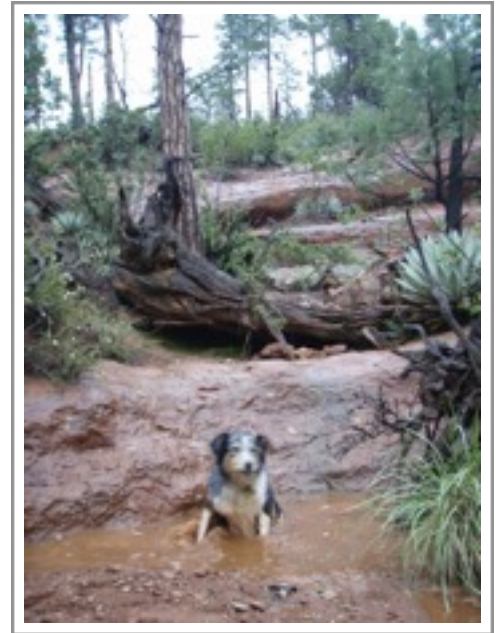
Cooling off wherever we can... Highline/Az Trail, Payson