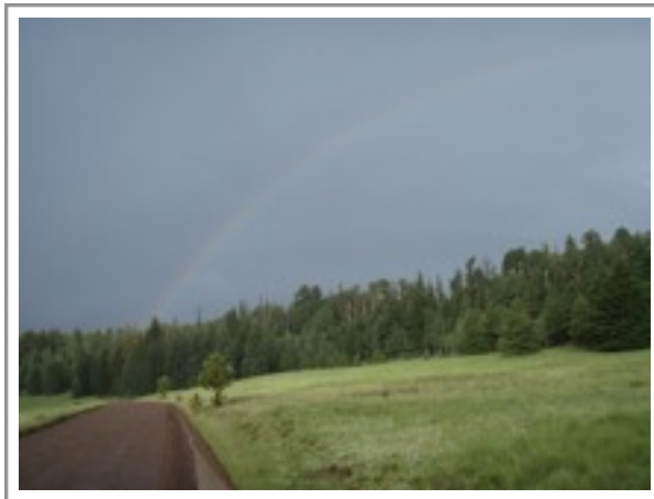
Rainbow outside Greer